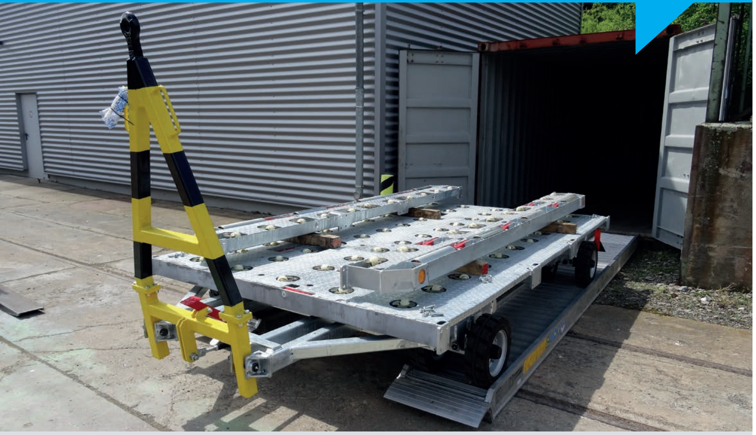
figure: D 10. 111-C-L

The dolly D 10. 111-C-L of the Blumenbecker Technik GmbH is faster transportable and maintenance-friendly . The dolly D 10. 111-C-L is also intelligent and adaptable .