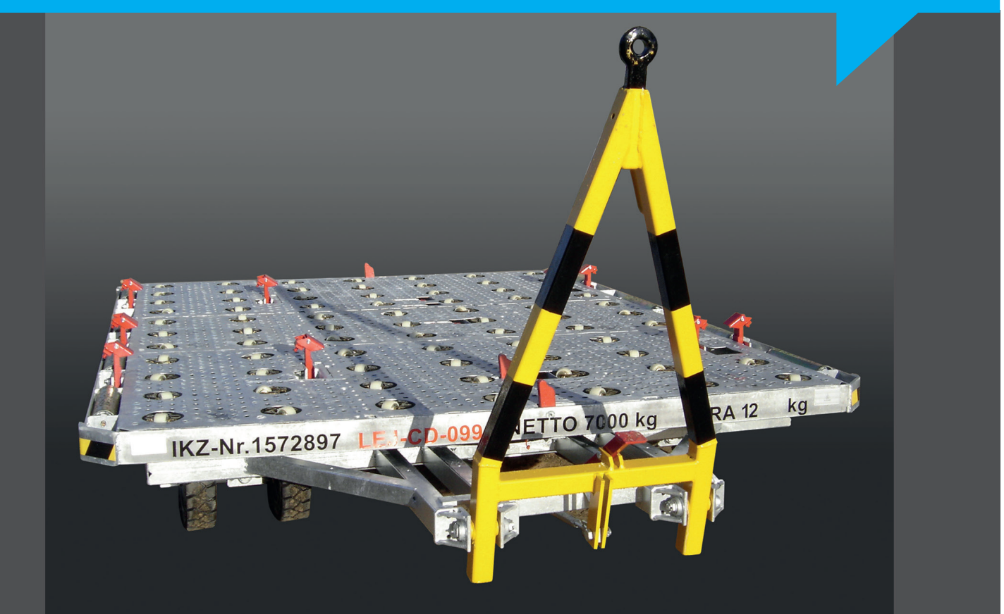
figure: DOLLY D 10.101-C-DL

The DOLLY D 10.101-C-DL was designed, constructed and built to transport pallets and containers of different formats.